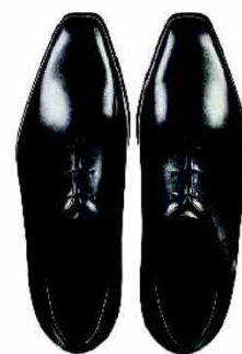
Berluti FW 18-19