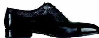
Stefano Ricci SS 19