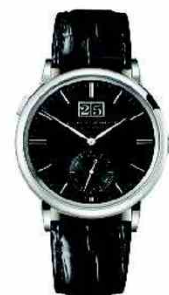
A. Lange & Söhne